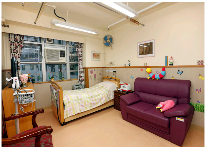
設立舒適的安寧房間 Set up a comfortable End - of - Life Care Room