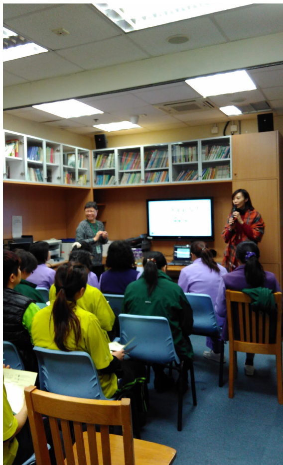
為院舍同工提供訓練 Provide training to the RCHE's staff

The ultimate goal of the project is to launch a comprehensive, evidence-based and sustainable end-of-life care model in most subvented RCHEs after the 3-year project period, and further roll out the model to all RCHEs in Hong Kong afterwards.